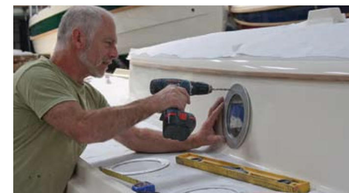
The port holes are suspended with masking tape until their exact positions have been determined. Then it's time to fit them and the rest of the hardware including the stanchion bases. Note the self-adhesive paper applied to the deck and coachroof to protect the gel coat during the fit-out

to the underneath of the deck and coachroof, through-bolting is generally the preferred approach.