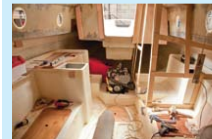
Another test-fit of the deck with the interior partly fitted out. Stick templates are made for the heads bulkheads