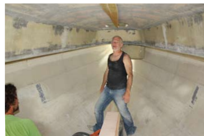
What's it like inside? Big and empty – and there's plenty of headroom