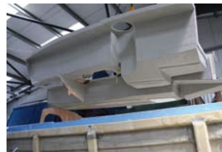
Now it's the turn of the aft section of the interior moulding to be lowered into the hull...