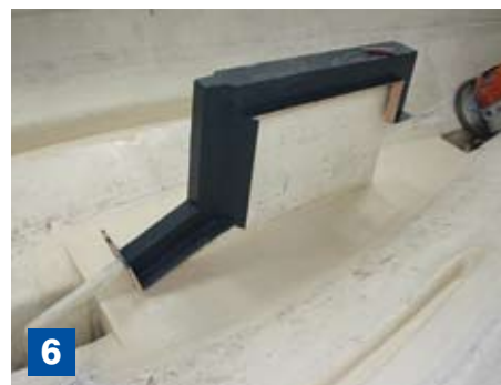
6 Now the resin and ballast are glassed in and a wooden plug is made for the moulding that will cover the top of the centreplate case.

First, wooden bulkheads were bonded into the keel each end of where the ballast castings were to be fitted. These would contain the resin poured into the keel to bond the castings in place.