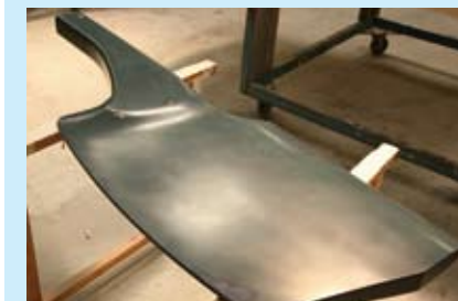
A plug is made for the transom-hung rudder