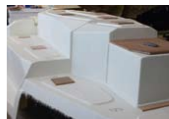
Plywood pads ready to be glassed in. Some are to stiffen areas of the sole, others to provide reinforcement in way of the release plates so the moulding isn't damaged when the plates are wound down