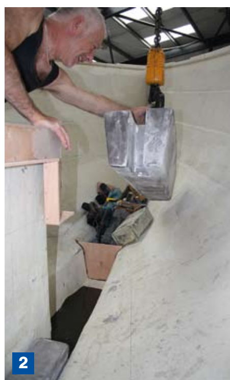
2 The 582kg (1,283lb) third casting is lowered in...