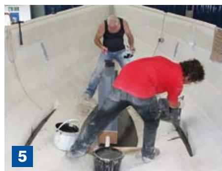
5 The resin is brought up to a level where it will be just below the cabin sole. It also fills the bilge keels, making them solid and thus stronger.