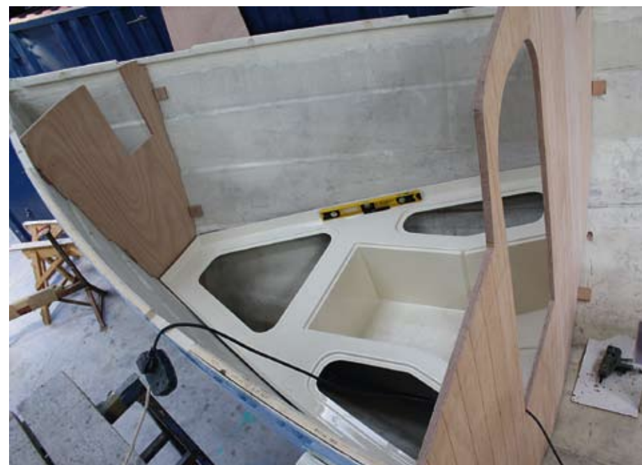
Here the interior moulding has been cut in two and the forward section dry-fitted into the hull together with the anchor-well and main bulkheads. It has been designed to allow a toilet to fit between the berths