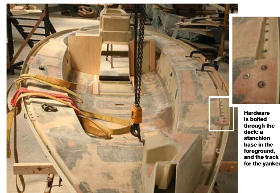
Inside the deck moulding, the plywood and balsa can be seen through the inner laminates. The dark areas are where filler has been applied to ensure an even thickness

As we explained in the August issue, the ballast has to be fitted to the 26 before the interior moulding goes in. That's because it's in the form of lead castings inside the keel: one each side of the centreplate case and one forward of it.