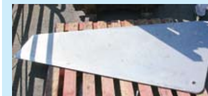
The centreplate arrives. Made from 20mm galvanised steel, it weighs 140kg (309lb)