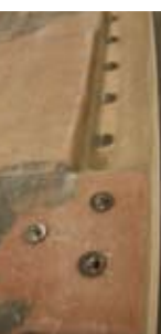
Hardware is bolted through the deck: a stanchion base in the foreground, and the track for the yankee