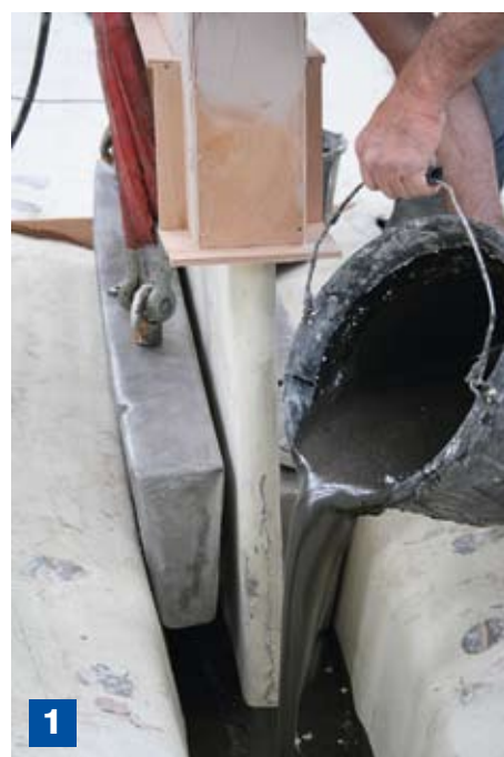
1 The lead ballast castings either side of the centreplate case are already in place. Now more resin is poured into the keel ready for the forward casting. Here we're looking aft.