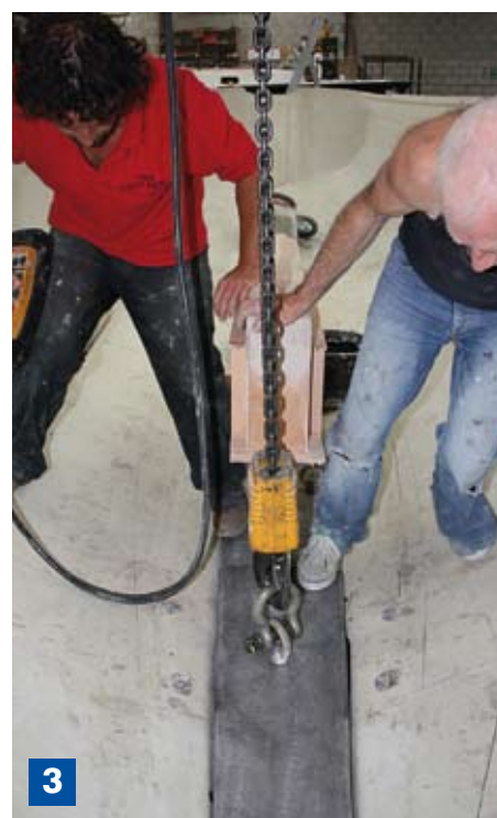
3 ... and settled into position on top of the resin.