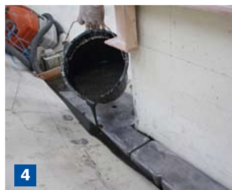
4 More resin is poured on top to fill any gaps between the hull moulding and the lead.