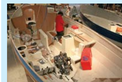
Fit-out is under way and the engine's going in