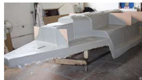
The completed interior moulding, with plywood stiffening glassed in as well as the athwartships locker-dividers