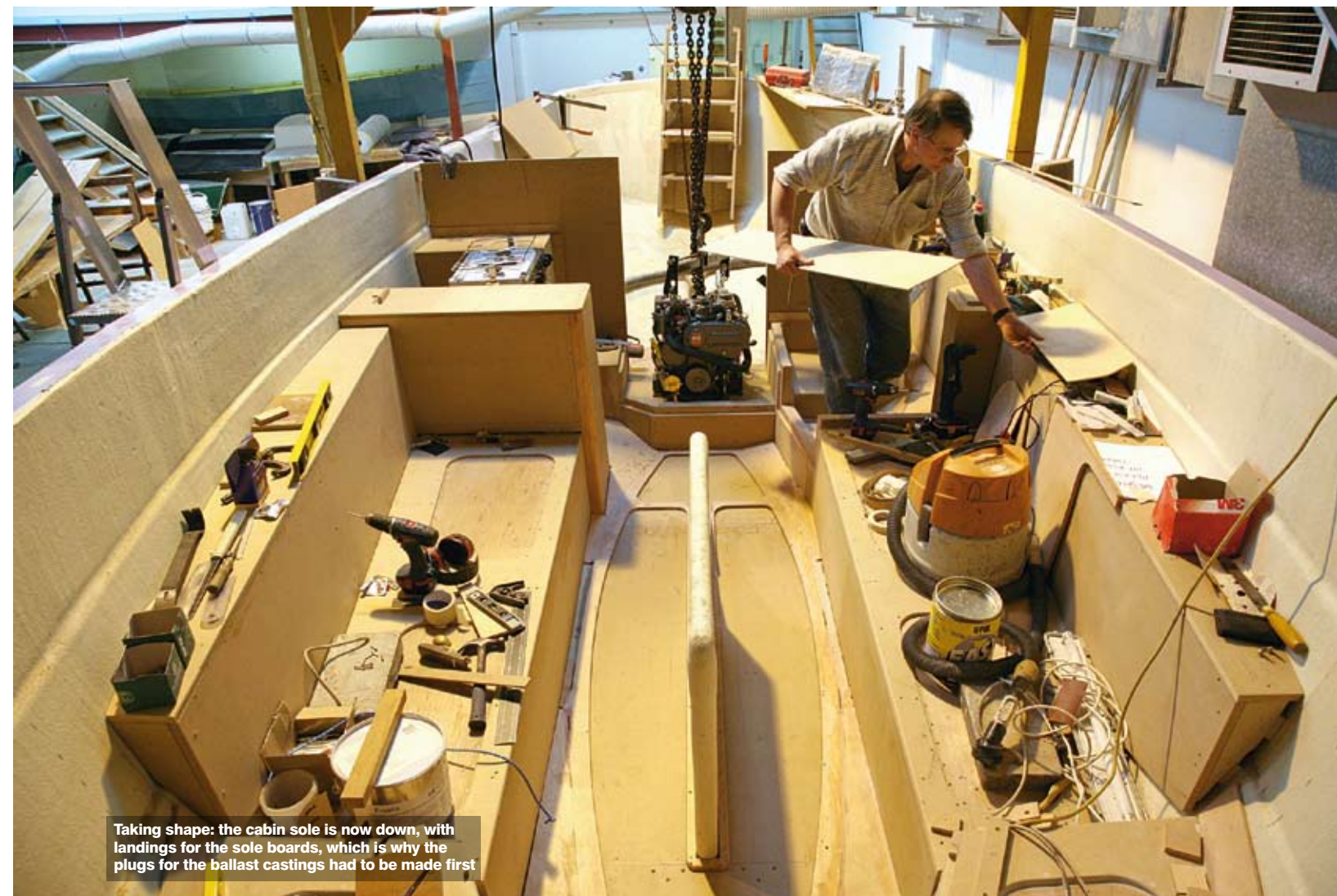
Taking shape: the cabin sole is now down, with landings for the sole boards, which is why the plugs for the ballast castings had to be made first

inside the moulding of the first hull which, in turn, was still sitting inside its mould. Until a hull is stiffened by the addition of bulkheads and some of the interior structure, it's surprisingly flexible and needs to be supported.