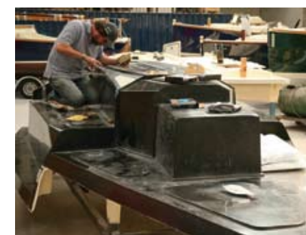
When a mould – here the interior – is released from a plug, some repair and finishing work is always needed prior to the final wax

While the interior plug was being built, the mould was also being laid up over the deck plug. Upon its completion, Crabbers had all three primary moulds. The deck and interior, unlike the hull, were black. This is because a mould needs to be of a colour that contrasts with the mouldings, so the laminators can see where they have