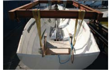
Bits of the interior plug still remain in the hull, principally around the centreplate case. The lifting points are bonded temporarily to the inside

The next job was to lower the hull into its 'ballast dolly'. This is a supporting structure, its shape taken from the hull plug, in which the moulded hulls will sit while the ballast, bulkheads and interior moulding are fitted.