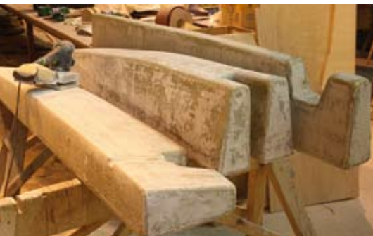
The plugs are made into fully enclosed boxes and smoothed and sanded, ready to be painted and delivered to the foundry

the hull and covers them. That means that Crabbers had to make the tooling for the ballast before starting on the plug for the interior moulding.