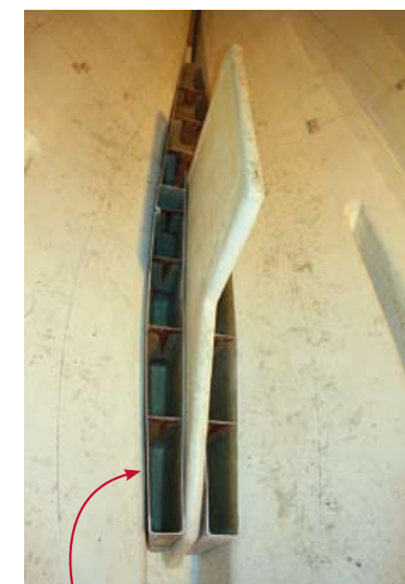
To ensure an accurate fit, plugs for the ballast castings are made inside the keel from thin plywood sheathed inside and out with glassfibre