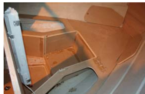
Life at the sharp end: the forecabin takes shape, its design having been modified to allow the heads to be mounted between the berths