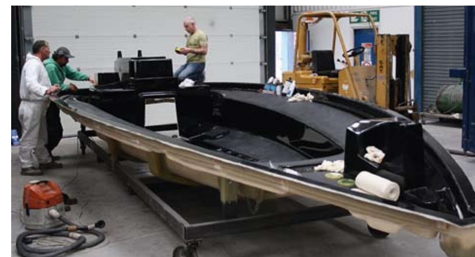
...and here it is being waxed and prepared for the laying up of the first deck. Deck moulds are often black, to contrast with the pale gel coat that will be laid up over them