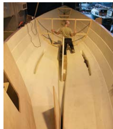
With the hull still in its mould for support, the centreline is marked and 'stick templates' are made for the anchor-well and main bulkheads

First, however, comes the tooling and, as we have seen with the hull and deck, the process starts with the construction of a plug built from timber and MDF. In the case of the interior, the plug had to be built