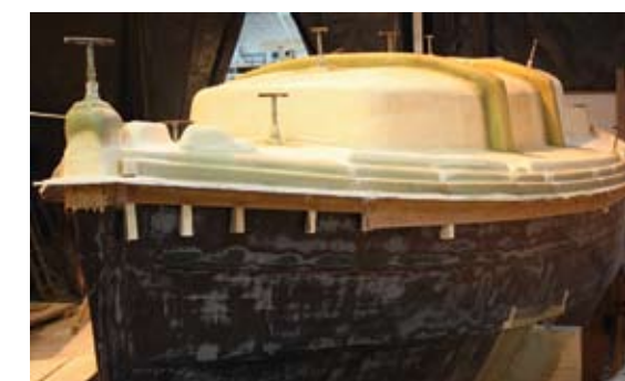
The deck mould laid up over the deck plug, ready for the metalwork and wheels to be added before it's lifted off and turned over...