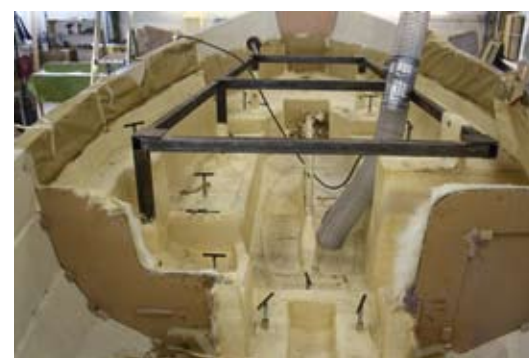
Here the mould has been laid up over the plug. Release plates are fitted and the metal framework is ready to receive the rest of its wheels