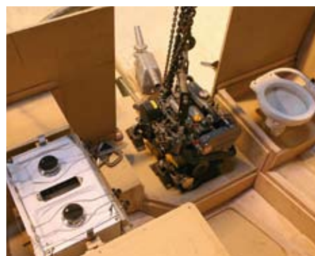
Three important pieces of equipment – the cooker, engine and heads – are positioned for checking. The interior moulding stops at the aft bulkhead