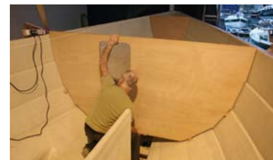
The solid plywood main bulkhead, with the door aperture cut out, is lifted into position

Other boats in Crabbers' range have ballast in the form of iron punchings (loose 'discs'), which can be poured into the bilge and then glassed in, but it was decided that solid castings in lead would be used for the 26: lead is denser, so the ballast is concentrated lower down in the hull for greater stability. It takes up less space and doesn't suffer from corrosion. Being in the form of three large blocks, however, the castings will have to be positioned in the keel before the interior moulding goes into