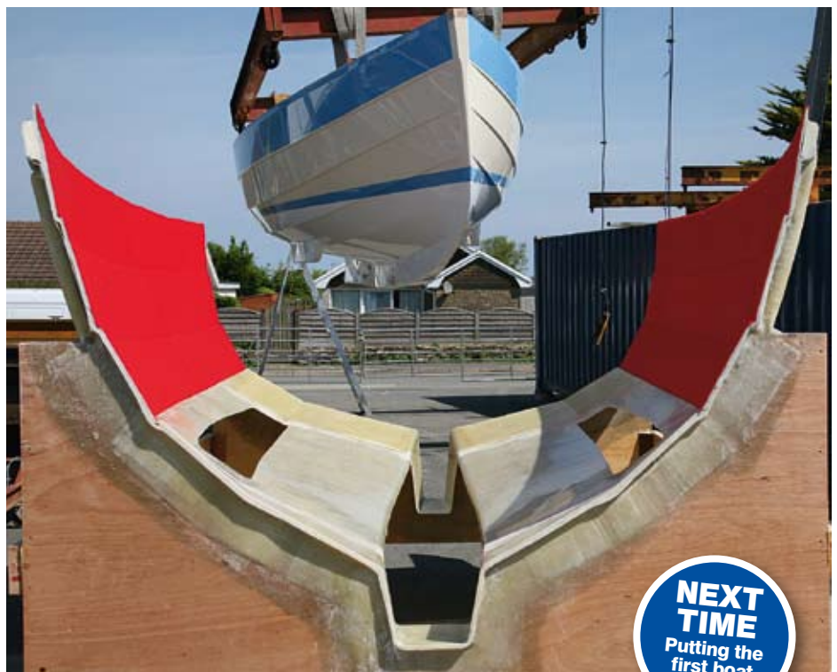
The 'ballast dolly', its shape taken from the hull plug, will support the hull while the ballast, bulkheads and interior moulding are fitted