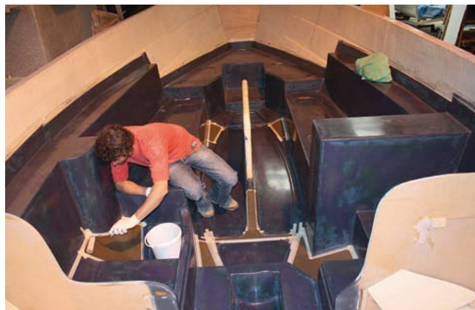
Filled, faired and painted, the plug is nearly complete. A non-slip finish is being applied to angled sections of the cabin sole at the forward end of the saloon and aft by the galley and in the heads

Important points to consider at this stage included making provision for ducting for a cabin heater to be run through the internal moulding, as well as where the skin fittings were going, accommodating wiring runs, and the exact siting of the batteries and the fuel, and holding tanks. An engine was lowered into position so the engine beds could be made, the angle of the prop-shaft checked and the need for an exhaust-riser established. The cooker and toilet were also dropped into