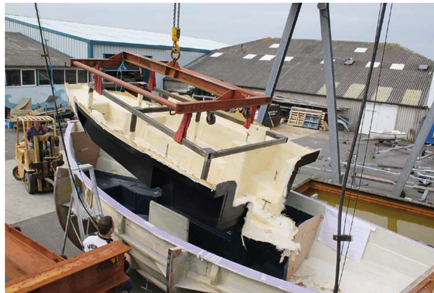
Moulds within moulds: the interior mould is lifted out of the hull, revealing the plug which can now be broken up and removed