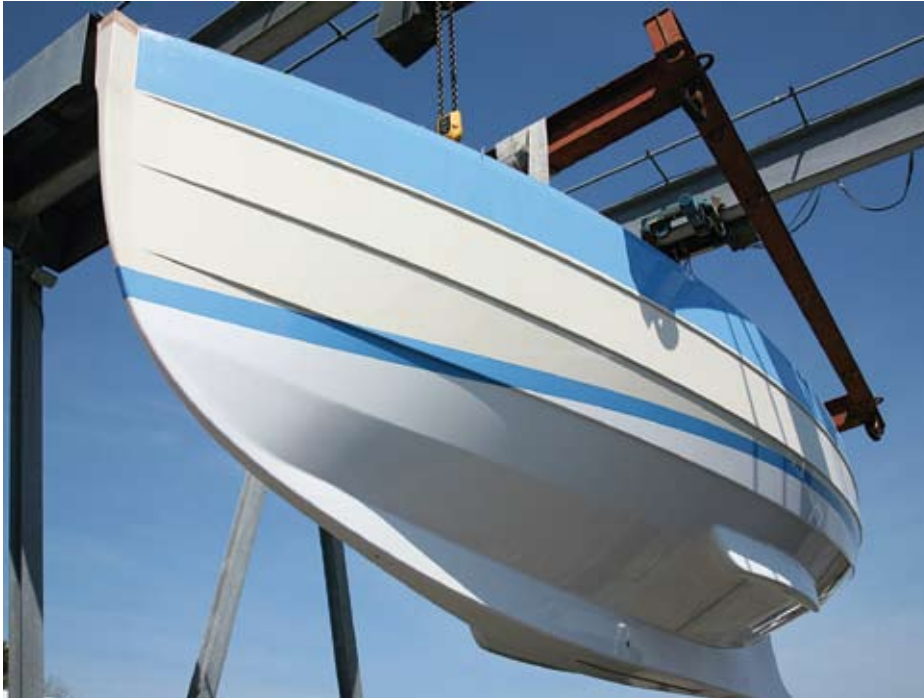
Released at last: the hull is lifted clear of the mould and its lines can be admired for the first time. Note the curved bilge stubs. A rubbing strake will sit immediately above the top chine

applied the gel coat. Hulls can be light or dark but are rarely lilac, so that was chosen for the hull mould. Since deck and interior mouldings tend to be pale in colour, black is the best colour for their moulds.