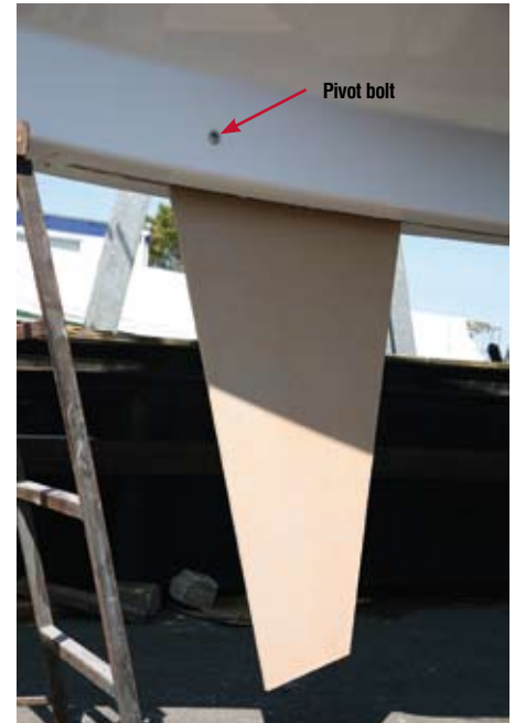
Before the centreplate is machined in mild steel, a template is made in MDF to ensure it fits the case in both raised and lowered positions